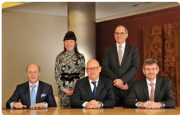
Executive Committee of BCEE

PricewaterhouseCoopers Société coopérative, Luxembourg