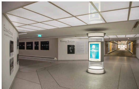
Contemporary art gallery "Am Tunnel"

Apart from its pure banking activities, BCEE is also involved in cultural activities such as its contemporary art gallery "Am Tunnel" and its "Bank Museum", the sponsoring of musical and sporting events as well as its youth and humanitarian activities.