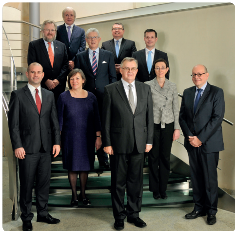
Board of Directors of BCEE